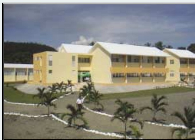
Back of new Cigar Family High School

To learn more about the community complex and support the foundation's efforts, please visit www.cigarfamilycharitablefoundation.org .