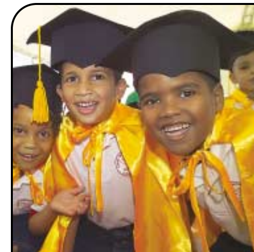
Happy faces from the graduating kindergardeners