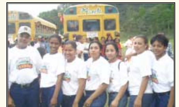
Key members of the Cigar Family School Staff