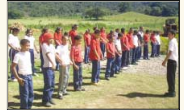
Physical Education class at the Cigar Family School