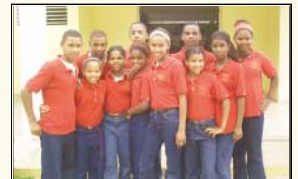
Students enrolled in the English Class at the Cigar Family School