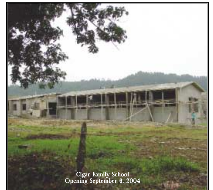
Cigar Family School Opening September 6, 2004