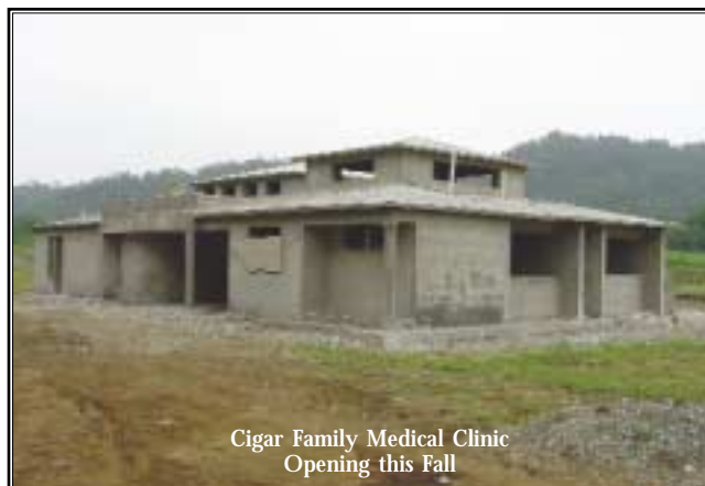
Cigar Family Medical Clinic Opening this Fall

Other aspects of the project are in full development such as the drainage, roads and electrical systems, which have nearly reached the completion stage.